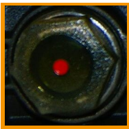
Oil Sight Glass