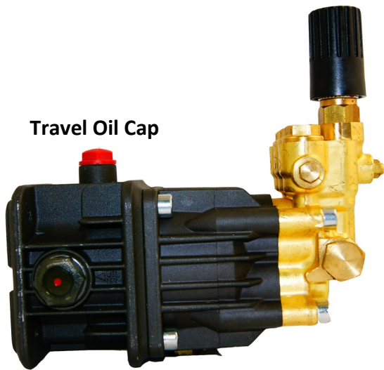
Travel Oil Cap