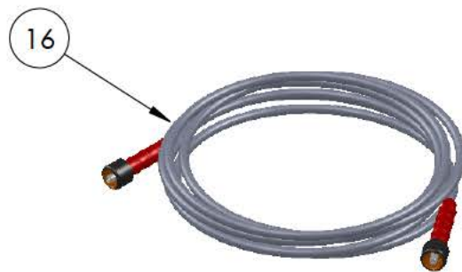
HOSE, 3400PSI 25FT PLATINUM M22-F x M22-F (PART NO. 7103726)