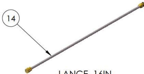
LANCE, 16IN (PART NO. 7103550)