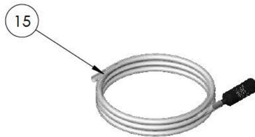
CHEMICAL HOSE AND FILTER KIT (PART NO. 7102207)