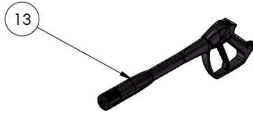
GUN 3500 PSI, 5GPM, M22-M INLET X M22 (PART NO. 7103569)